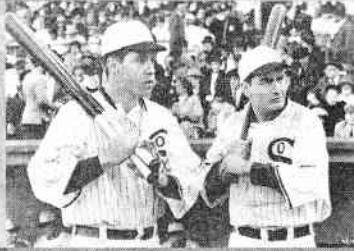
"EIGHT MEN OUT"