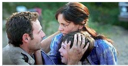
ZOMBIE SLAYERS: Andrew Lincoln (left) and Sarah Wayne Callies star in "Walking Dead," but Jon Bernthal could be the breakout star.

It was inevitable that the hit series "The Walking Dead" would be renewed this week after only two episodes. The show's premiere scored 5.3 million viewers — and more than 8 million total when you include the DVR and rerun audience. For the past few years, cable network AMC, which commissioned the horror series, has dominated the Emmys with shows like "Mad Men" and "Breaking Bad." But now, "The Walking Dead" has done something the others never did: score big ratings. So here are some things about this game-changer of a series you never knew to ask: 1 "Did we say six episodes? We meant 16!" AMC executives are probably kicking themselves for their caution in green-lighting just six episodes. Season 2 will have 13 — but no word yet on how soon they'll be able to start filming.