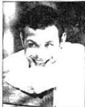
Brit winner Will Young waited a year to for his CD to be released.