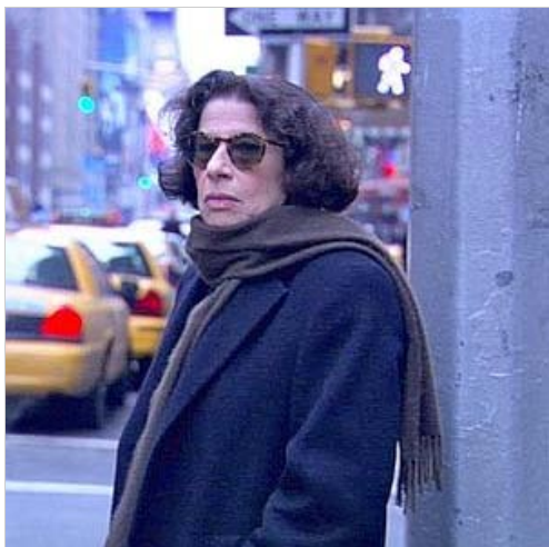
Fran Lebowitz prowls the city.

There are a lot of people who've never heard of Fran Lebowitz — for good reason. No matter how much you laughed when she first published her bestselling essay collections, "Metropolitan Life" and "Social Studies," you can't help but notice she has been absent from the "New Books" section of Barnes & Noble for nearly 30 years. Martin Scorsese has decided to capture this endangered New York icon in her favorite booth at the Waverly Inn, giving lectures and on-stage in conversation with her friend, Nobel Prize winner Toni Morrison. It all adds up to a new documentary, "Public Speaking." Even if she doesn't like to write, Leibowitz loves to gab, which she did with the Post.