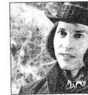
Depp wigs out in "Charlie"

WHO knows why the less remake became a hit? The sets are identical to the 1971. And the songs — us ward lyrics direct Roald Dahl book — weaker. Finally, John is so desperate to be from the brilliant Gene that he's just plain Extras include how like an Oompa-Loompa chance at a Golden T