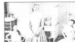
"Oklahoma!" gets purried up.

RODGERS & Hammerstein's best musical has always seemed a bit stodgy on film. But this new two-disc set of the 1955 movie may change that. It includes both the Cinemascope version and the rarely seen Todd-AO version. Both were shot simultaneously, but the Todd-AO version is considered by fans to be better acted. Indeed, even the title sequence and opening song are subtly different and better. This "Oklahoma!" is more than OK.