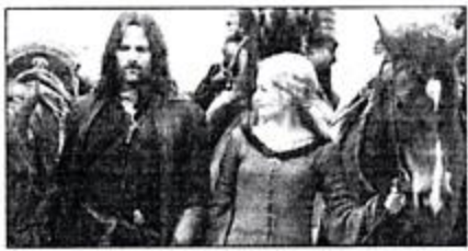
Viggo Mortensen (Aragorn) and Miranda Otto (Eowyn) in "The Lord of the Rings: The Two Towers."