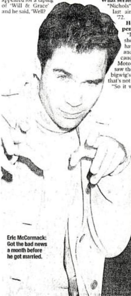
Eric McCormack: Got the bad news a month before he got married.