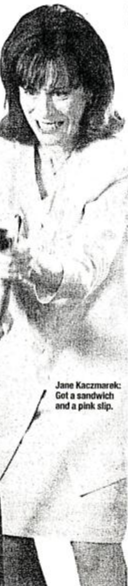
Jane Kaczmarek: Got a sandwich and a pink slip.