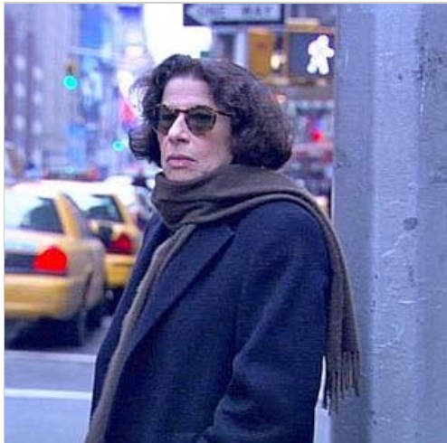
Fran Lebowitz prowls the city.

There are a lot of people who've never heard of Fran Lebowitz — for good reason. No matter how much you laughed when she first published her bestselling essay collections, "Metropolitan Life" and "Social Studies," you can't help but notice she has been absent from the "New Books" section of Barnes & Noble for nearly 30 years. Martin Scorsese has decided to capture this endangered New York icon in her favorite booth at the Waverly Inn, giving lectures and on-stage in conversation with her friend, Nobel Prize winner Toni Morrison. It all adds up to a new documentary, "Public Speaking." Even if she doesn't like to write, Lebowitz loves to gab, which she did with the Post.