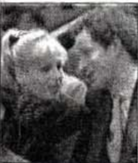
In "You Cannot Be Serious," the tennis great and devoted musician says he wept when he realized his marriage to Tatum O'Neal (that's them in '66) was over.