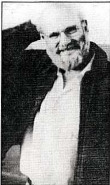
"At First Sight" is based on the book "An Anthropologist on Mars," by Dr. Oliver Sacks.

Being able to sell the paintings of a man who was virtually blind for most of his life? Remarkable as it seems, that's one opportunity no longer beyond comprehension.