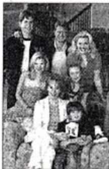
Reba plays a Texas housewife trying to raise her kids after her husband runs off with a dental hygienist in the WB's "Reba."

McEntire had to take a pass, but it wasn't really a close call. "They didn't have a leading man or even a director chosen yet," says the 57-year-old Oklahoma native, who will present an award