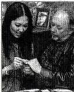
Kimora Lee Simmons shows off her jewels to Leach.

"The fact that we're doing this show on a network at my age with my girth and lack of hair is testament to the fact that television is not always owned by Jessica and Paris," he says.