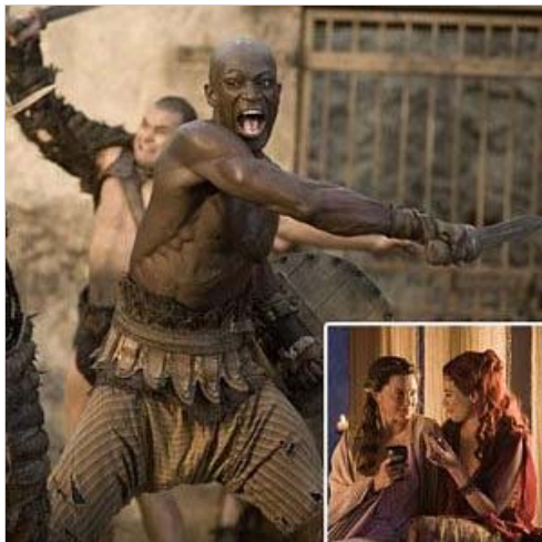
RAW RAGE: PeterMensah, Lucy Lawless (inset right) and Jaime Murray (above) stars in "Spartacus: Gods of the Arena."

"That's nothing, mate," says Lucy Lawless, the New Zealander who shot to fame as Xena and also had a major role on the acclaimed " Battlestar Galactica " reboot. "I'm forbidding my parents to watch."